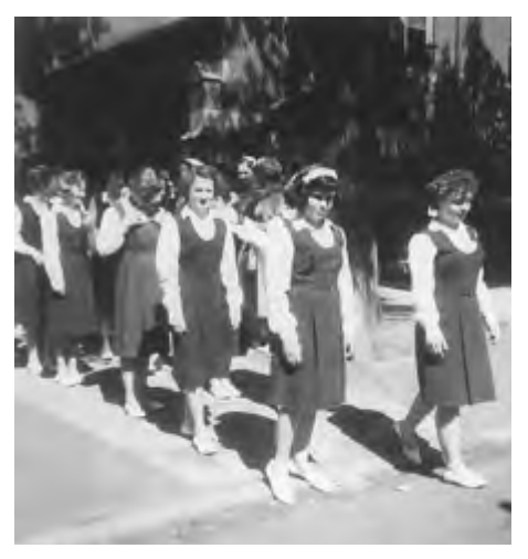
Eighth grade procession from Mass in St. Mark's Church to graduation ceremony in the gym, later called Joe Meyer gym.